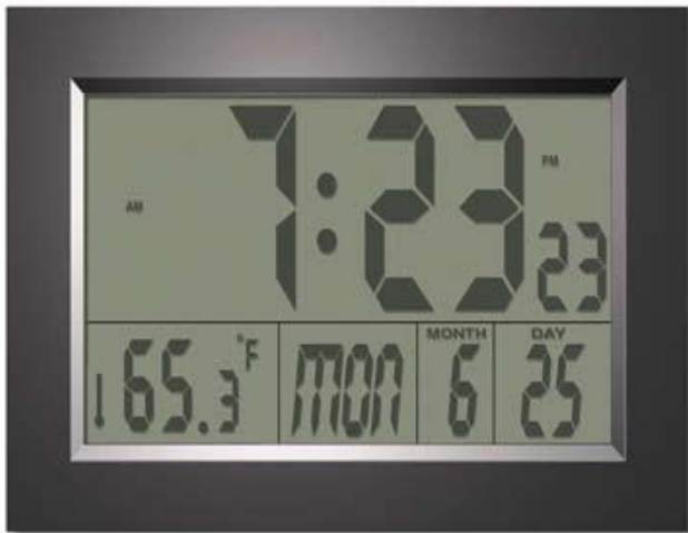
Part # 732000