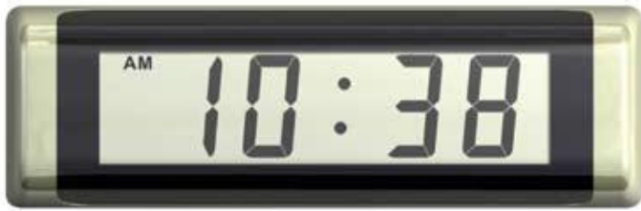
2.5" 4-digit LCD Part # 731000